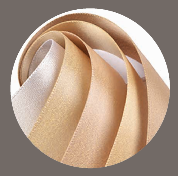
Gold Glitter Metallic 676