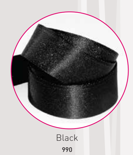
Widths available in these colours.