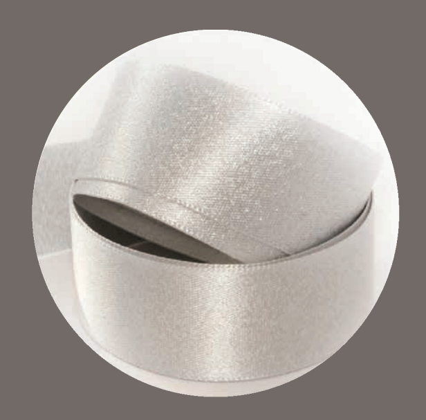
Silver Glitter Metallic 675