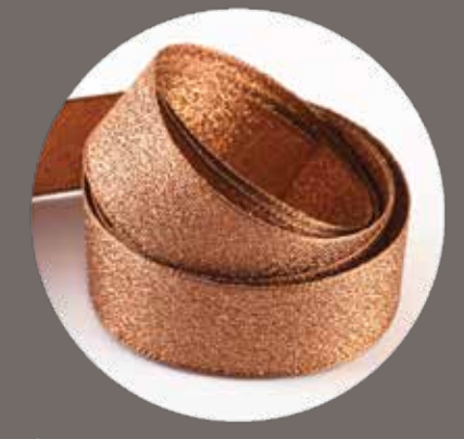
4505 Polyester Lame