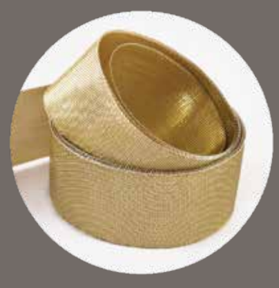
495 Liquid Metallic Nylon