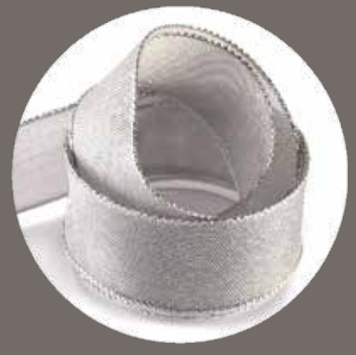
490 Metallic with Wire Edge