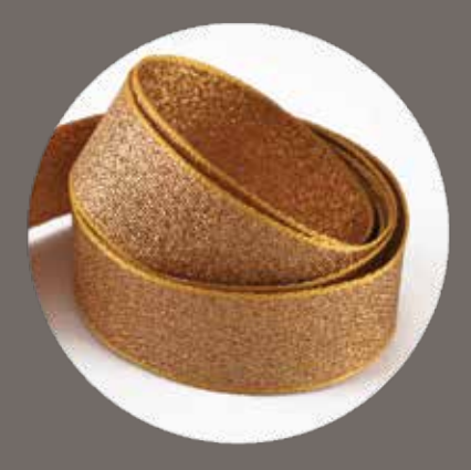
Dark Gold For this colour there is a MOQ of 10,000 metres