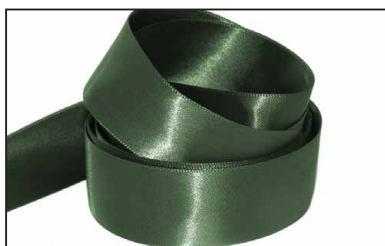
Village Green 750

Item can be dyed to order MOQ 5,000 Metres