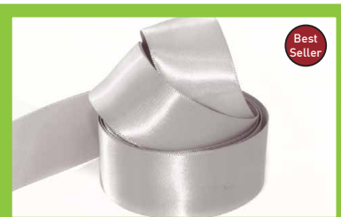
Silver Coin 920

Available in 5mm, 7mm, 10mm, 15mm 25mm, 38mm, 50mm.