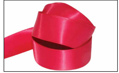
Paris Pink 470

Widths with extended lead times Approx 2-3 weeks 12mm, 20mm.