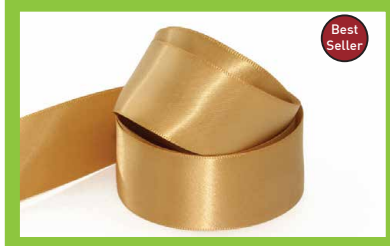
Sand Dune 150

Available in 5mm, 7mm, 10mm, 15mm 25mm, 38mm, 50mm.