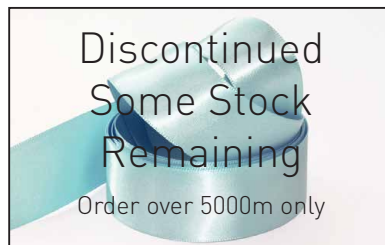
Angel Blue 705

Discontinued Some Stock Remaining Order over 5000m only