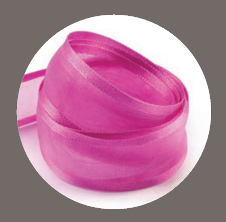
Satin Edge Sheer