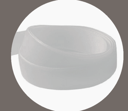
Silver 012 16mm, 23mm & 38mm