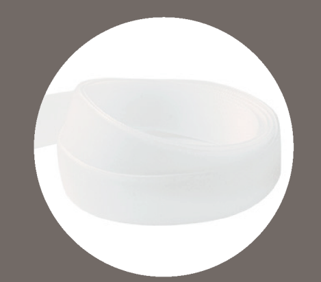
White 029 16mm, 23mm, 38mm & 50mm