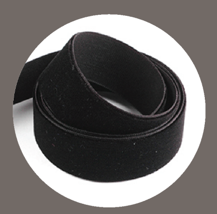
Black 030 16mm, 23mm,38mm & 50mm