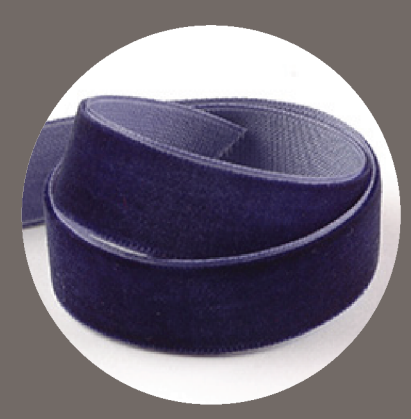
Navy 370 16mm, 23mm & 38mm