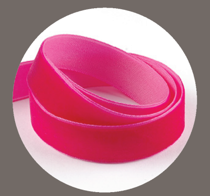
Azalea 187 16mm, 23mm & 38mm