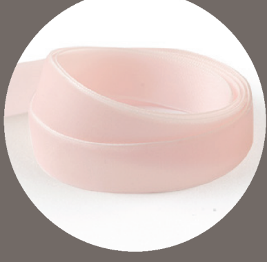
Powder Pink 115 6mm, 23mm & 38mm