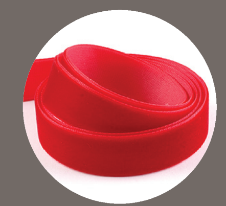
Red 250 16mm, 23mm, 38mm & 50mm